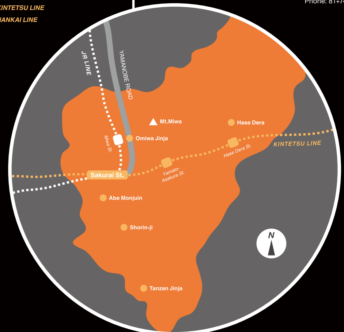
Sakurai City Map